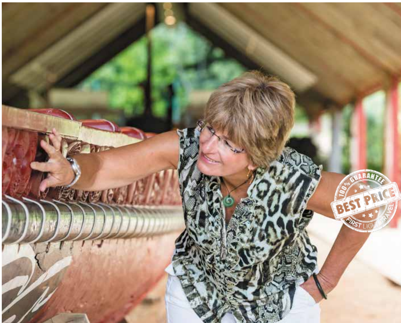
Waitangi Treaty Grounds, New Zealand's most important historic site.