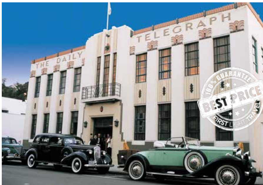
Enjoy an overnight stop in Napier, known as 'The Art Deco Capital'.