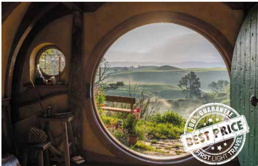
Experience the real Middle-earth on a tour of the Hobbiton Movie Set.