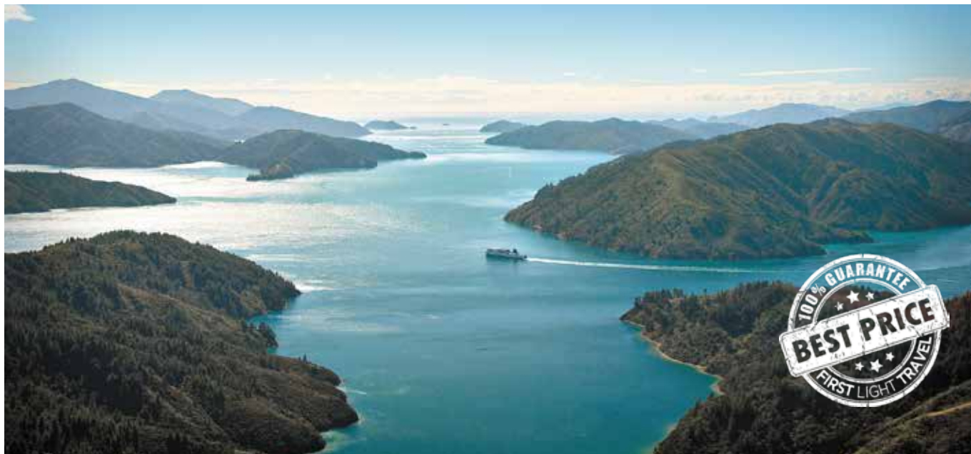
Board the Interislander Ferry in Picton for your journey through the Marlborough Sounds to Wellington.