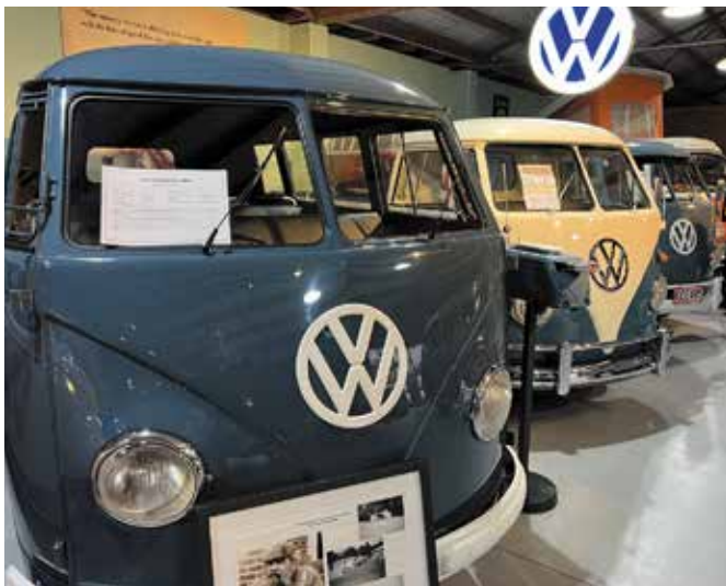
Explore vintage vehicles and transport history at Bill Richardson Transport World.

SPEND 3 NIGHTS IN QUEENSTOWN Experience the breathtaking beauty of Queenstown with an unforgettable three-night stay. Nestled on the pristine shores of Lake Wakatipu, this alpine paradise offers breathtaking scenery, thrilling outdoor activities, and vibrant nightlife. Discover the region's renowned vineyards, historic mining towns and picturesque streets. Savour gourmet dining and unwind in luxurious accommodations while surrounded by majestic mountains.