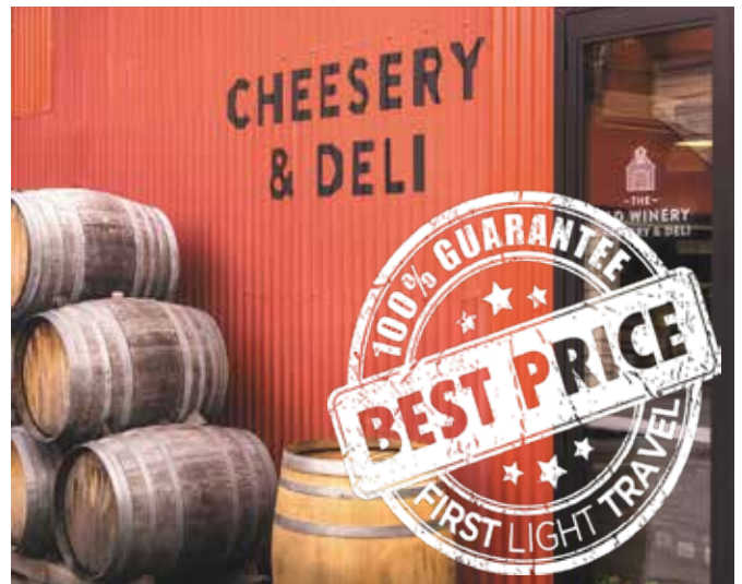
Savour world-class wines and a delicious lunch at Gibbston Valley Winery