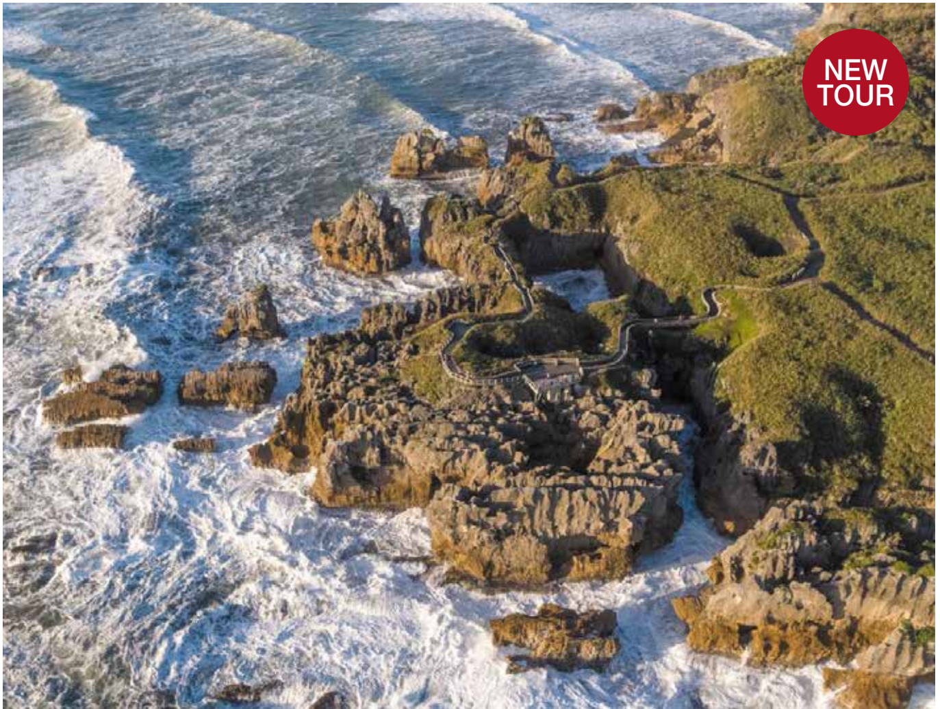
Aerial overview of the unique set up of walkways and viewing platforms of the world-famous Punakaiki Pancake Rocks and Blowholes.