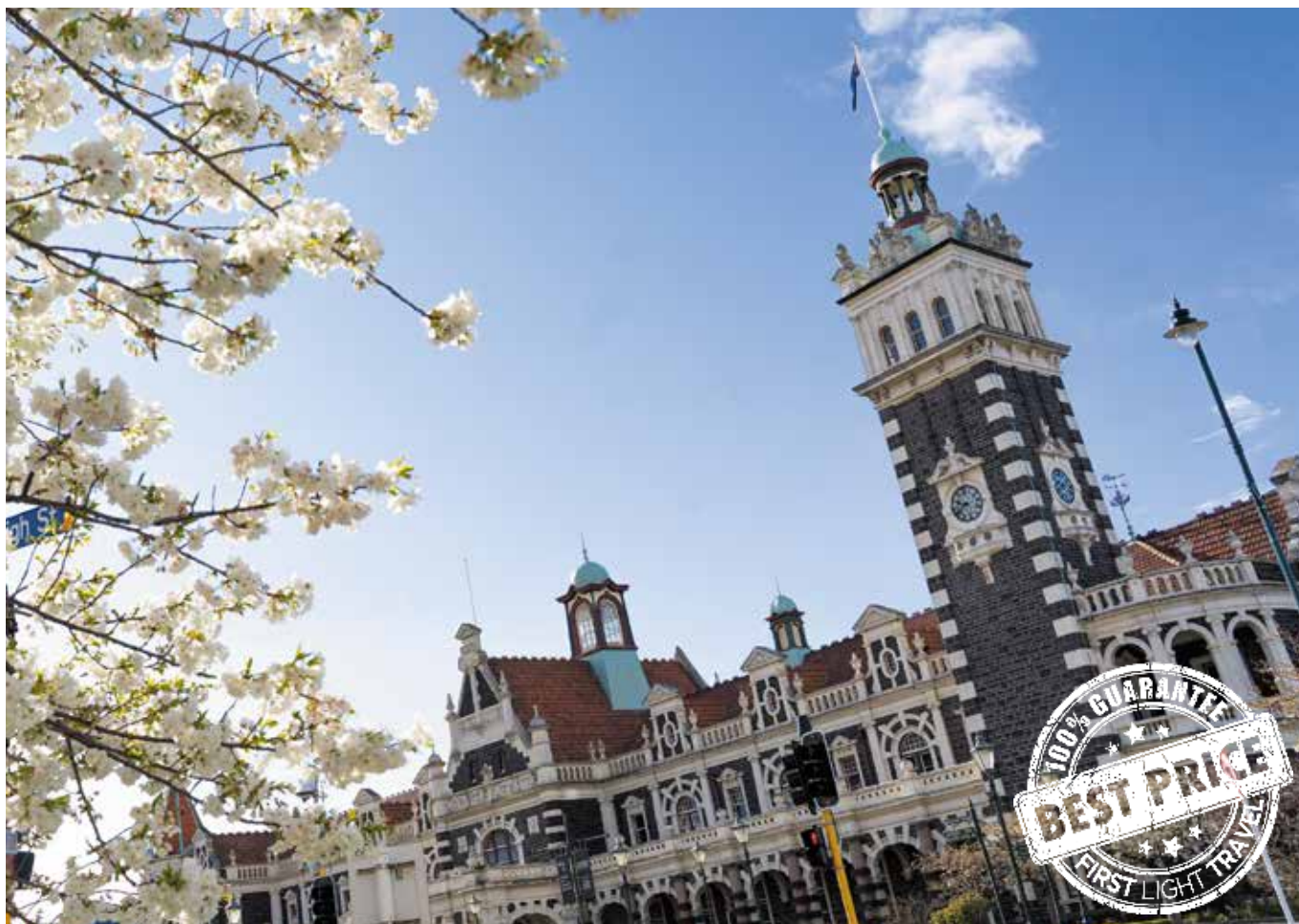
Enjoy time to wander around Dunedin's Edwardian and Victorian architecture.

Your Coach Captain is available to help you choose from the many optional activities available. This evening is also free to dine at one of the many fine restaurants.