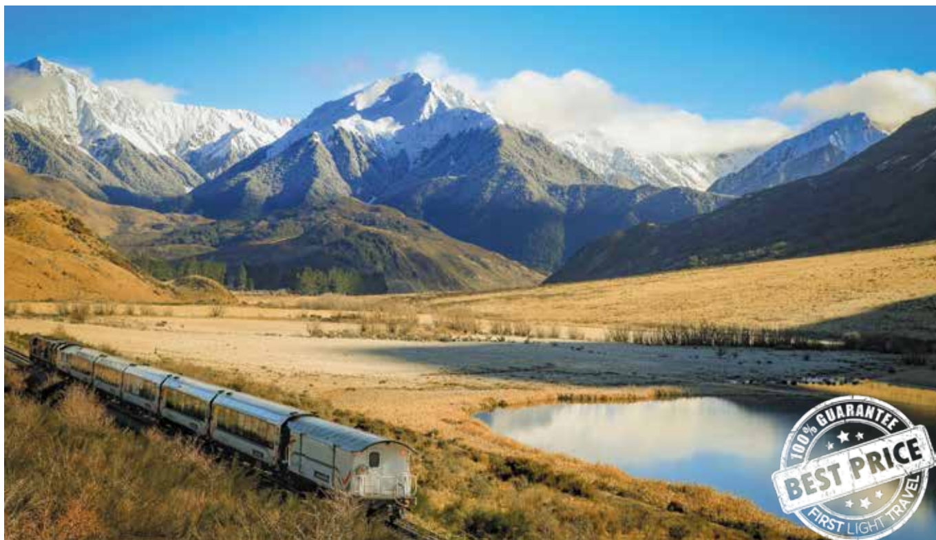
The TranzAlpine, renowned as one of the great train journeys of the world.