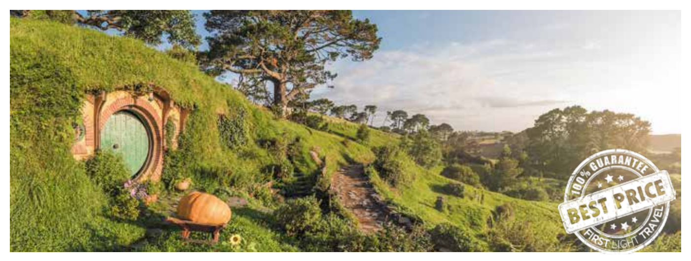
Experience the Hobbiton Movie Set on a guided tour.