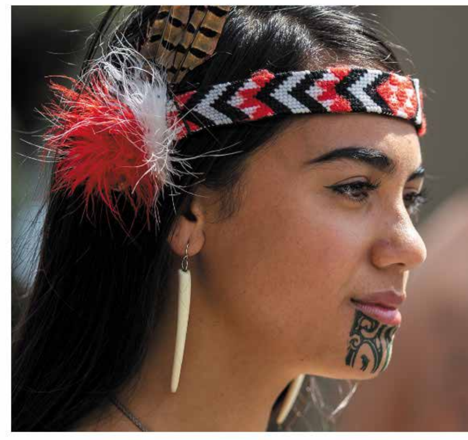
20 Sout Ducinose Clase or 22 Sout Dromium Economy