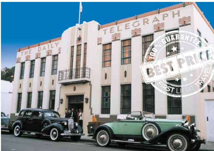
Enjoy an overnight stop in Napier, known as 'The Art Deco Capital'.

This morning board the TranzAlpine, renowned as one of the great train journeys of the world. Travel over massive viaducts, river valleys and spectacular gorges as you ascend to Arthur's Pass located in the centre of the Southern Alps. Board your Ultimate Coach and travel to Hokitika, famous for its Greenstone before continuing via Franz Josef to the township of Fox Glacier where time is available to