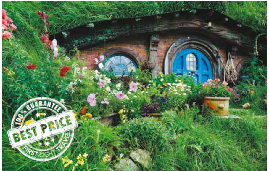
Experience the real Middle-earth on a tour of the Hobbiton Movie Set.

This morning board the TransAlpine, renowned as one of the great train journeys of the world. Travel over massive viaducts, river valleys and spectacular gorges as you ascend to Arthur's Pass located in the centre of the Southern Alps. Board your coach and travel to Hokitika, famous for its Greenstone before continuing to the township of Franz Josef where time