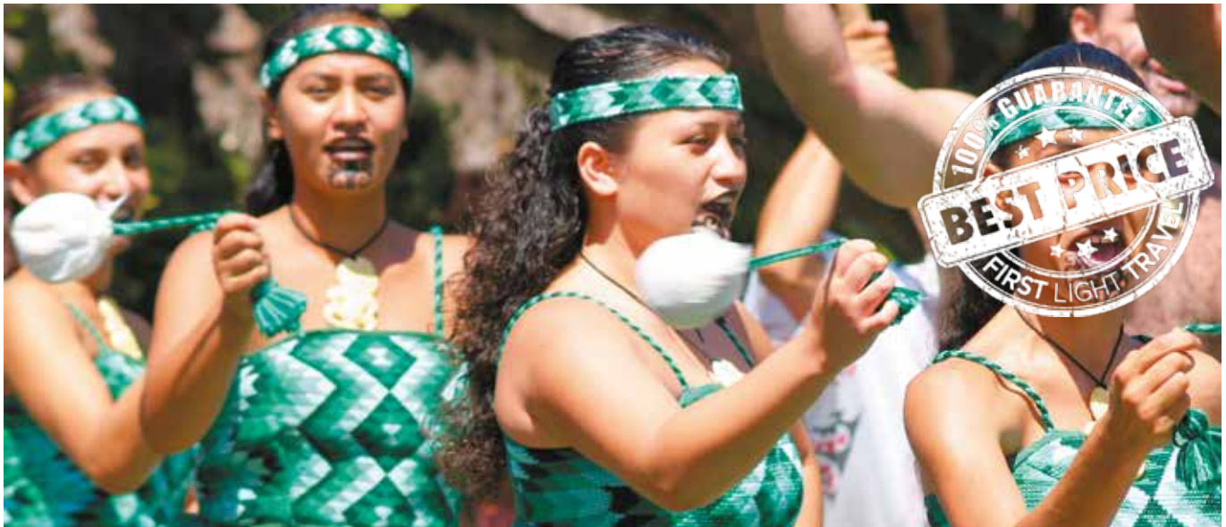
In Rotorua enjoy a Māori cultural performance which features the graceful poi dance.