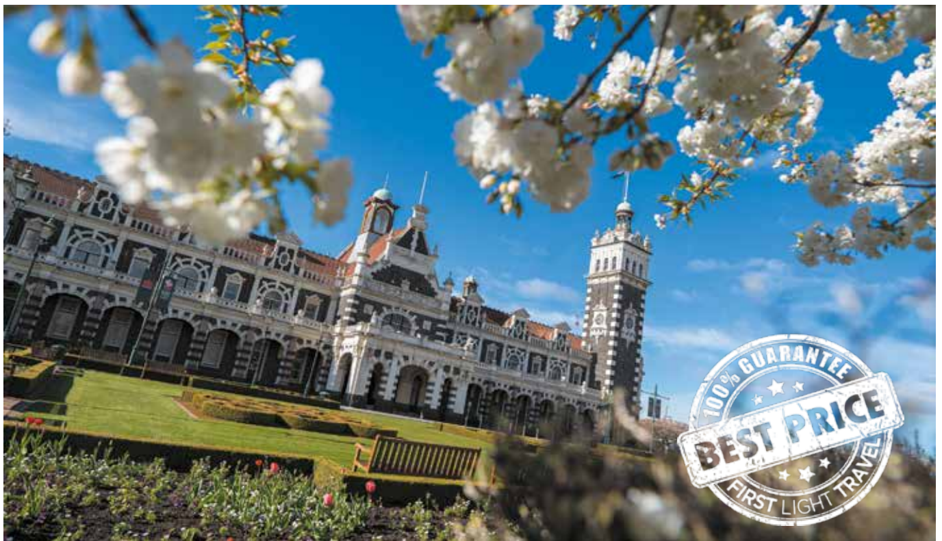
Dunedin Railway Station, one of the city's most prominent architectural landmarks.