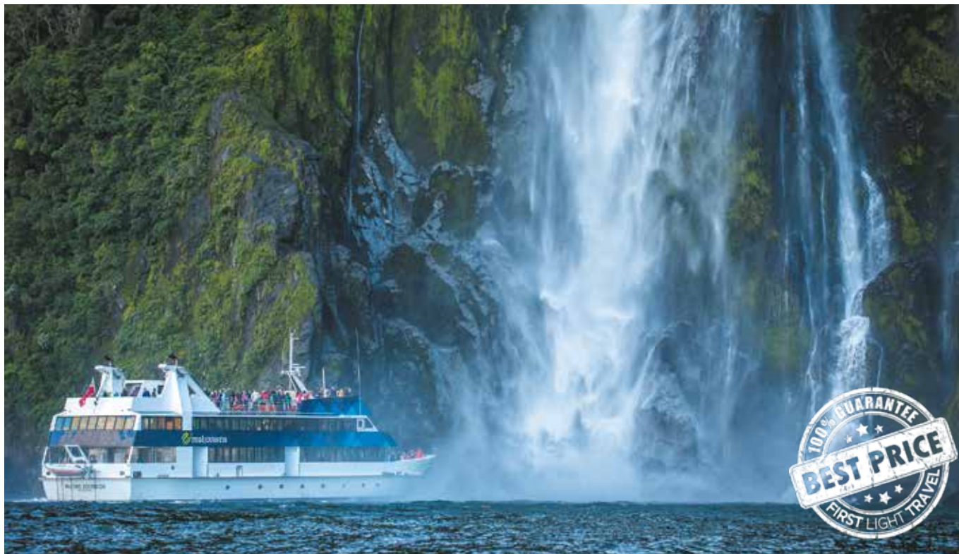
Board your launch for a cruise on the magnificent Milford Sound. See the spectacular Bowen Falls and towering Mitre Peak as you enjoy lunch onboard.