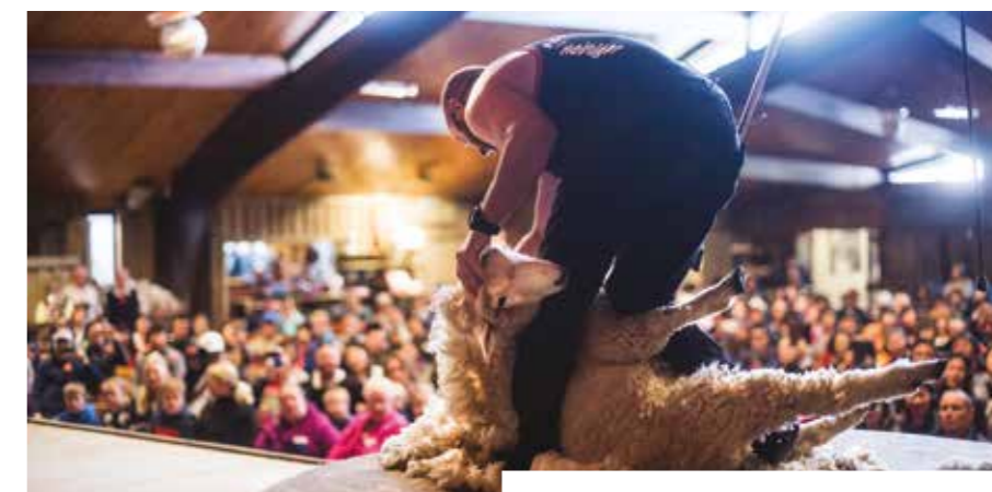
See the world-famous Farm Show at Agrodome starring a cast of talented animals.

Time to say goodbye. You will be transferred to the airport for your flight home after a memorable New Zealand holiday.