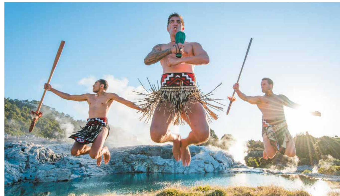
You will be immersed in the traditions and customs of Māori culture in Rotorua.

Day 1: Dinner not included for anyone arriving later than 8pm.