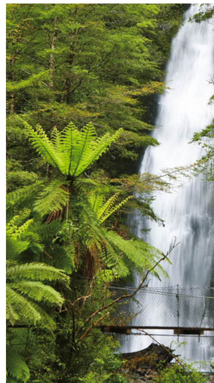
Hiking the Hollyford Track.