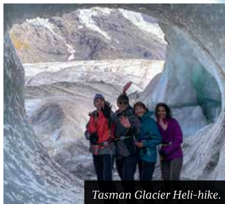
Tasman Glacier Heli-hike.