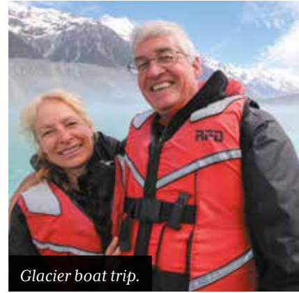
Glacier boat trip.