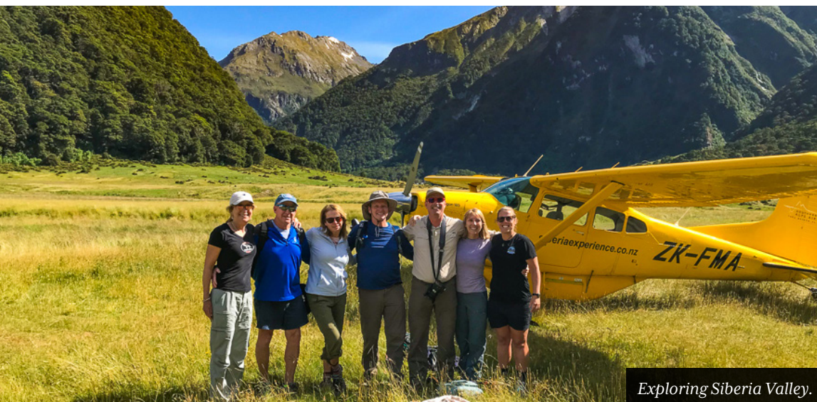
Exploring Siberia Valley.