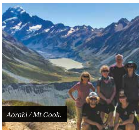
Aoraki / Mt Cook.