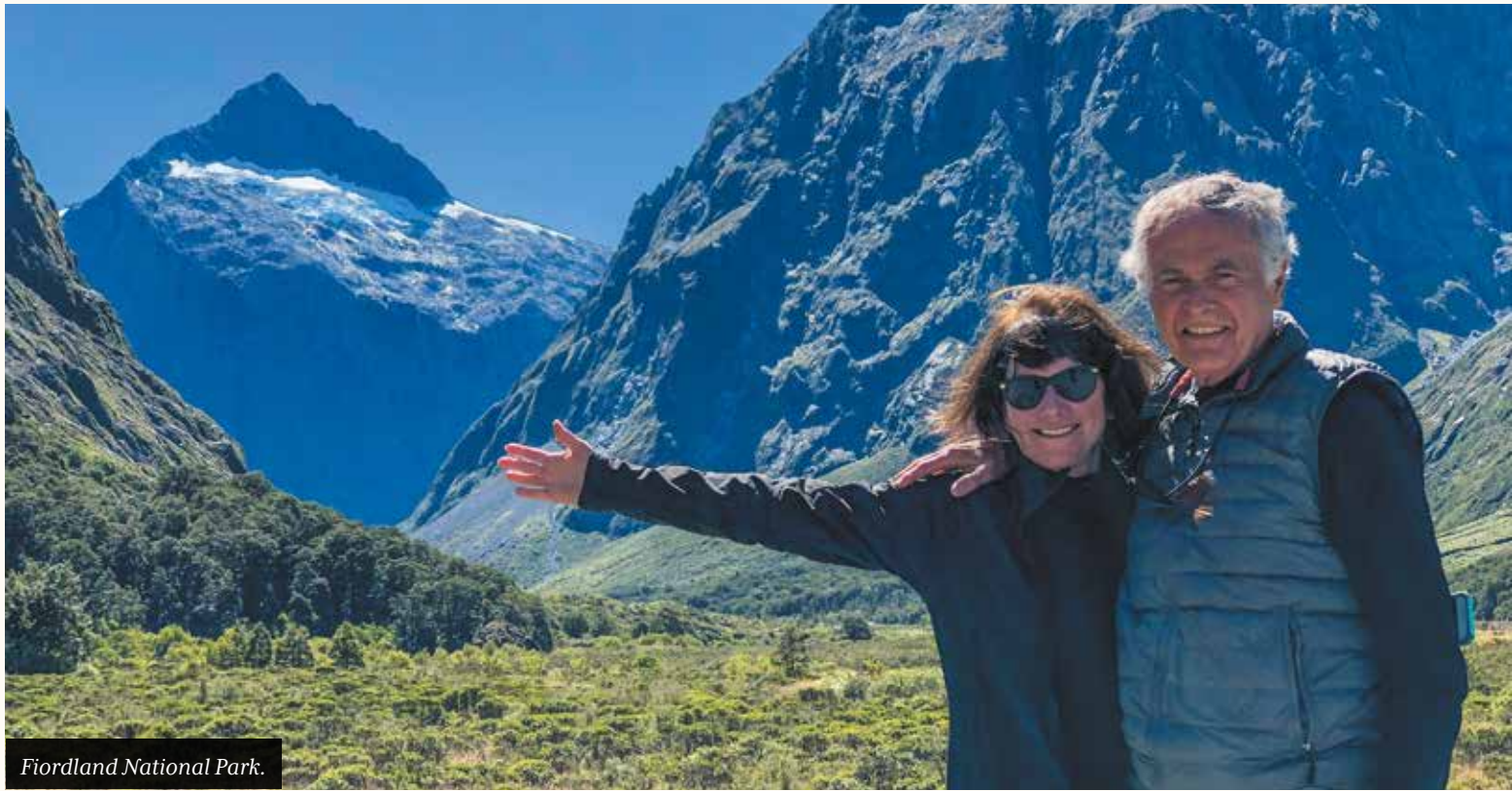
Fiordland National Park.