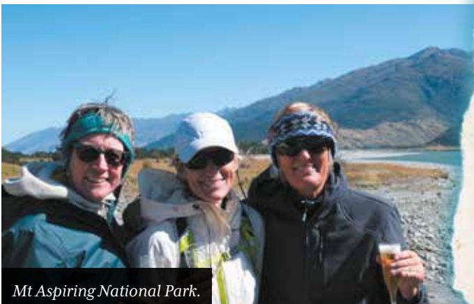
Mt Aspiring National Park.