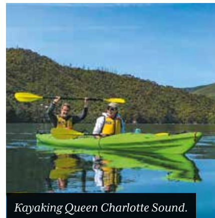
Kayaking Queen Charlotte Sound.