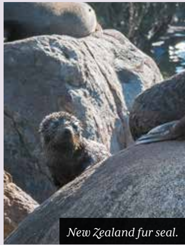
New Zealand fur seal.