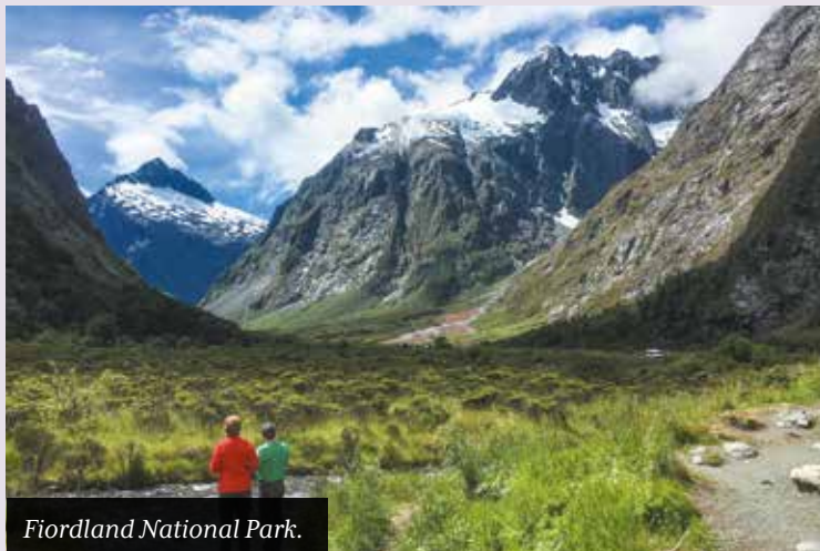
Fiordland National Park.