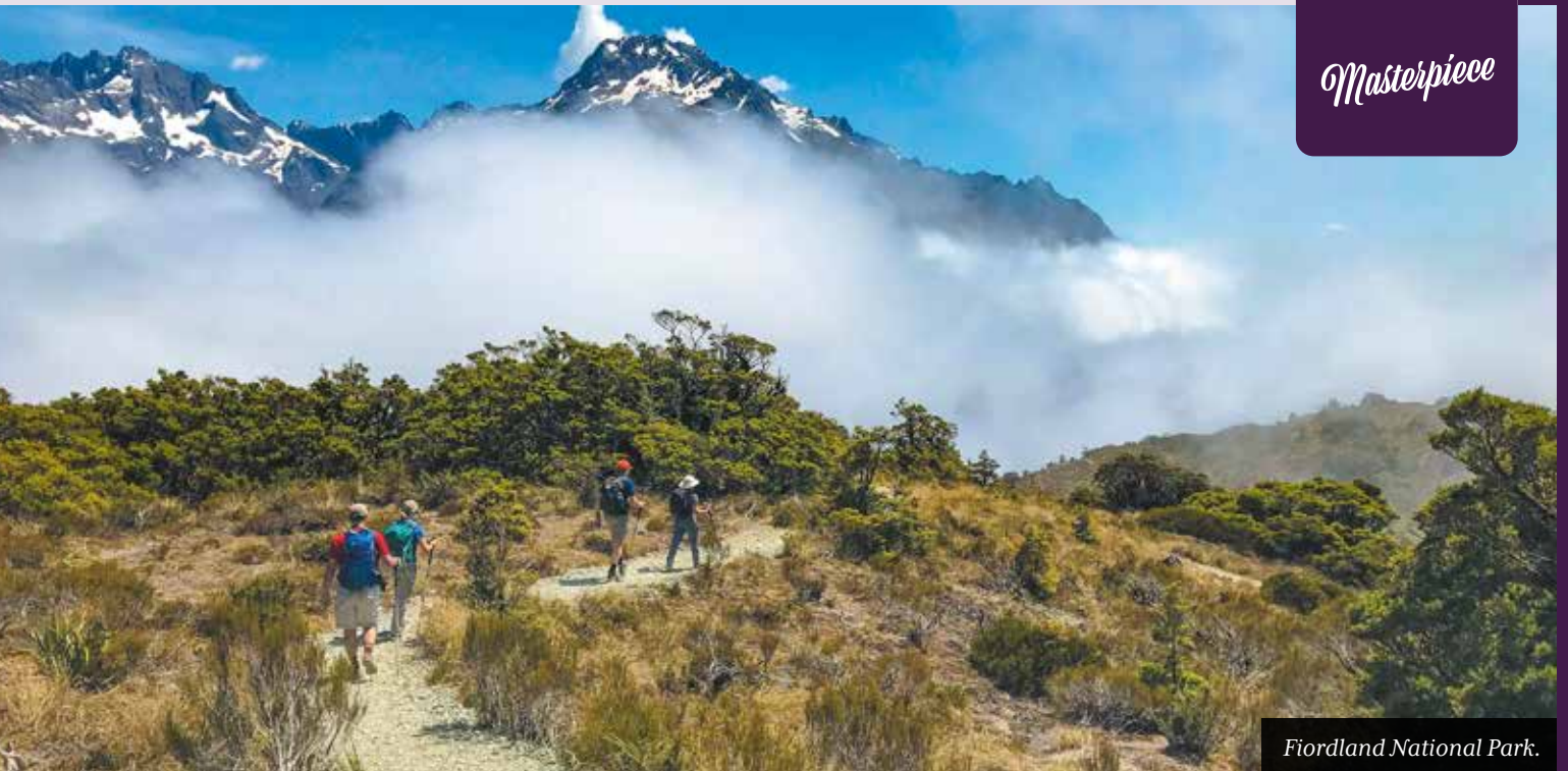
Fiordland National Park.

“What do you say when you run out of superlatives?! The Masterpiece trip was just that... a masterpiece! Spectacular scenery, awesome hikes, magnificent views (that we earned), great meals, super guides and an incredible variety of activities. Our guides were really tuned into our small group and made the trip even better than we had expected.”