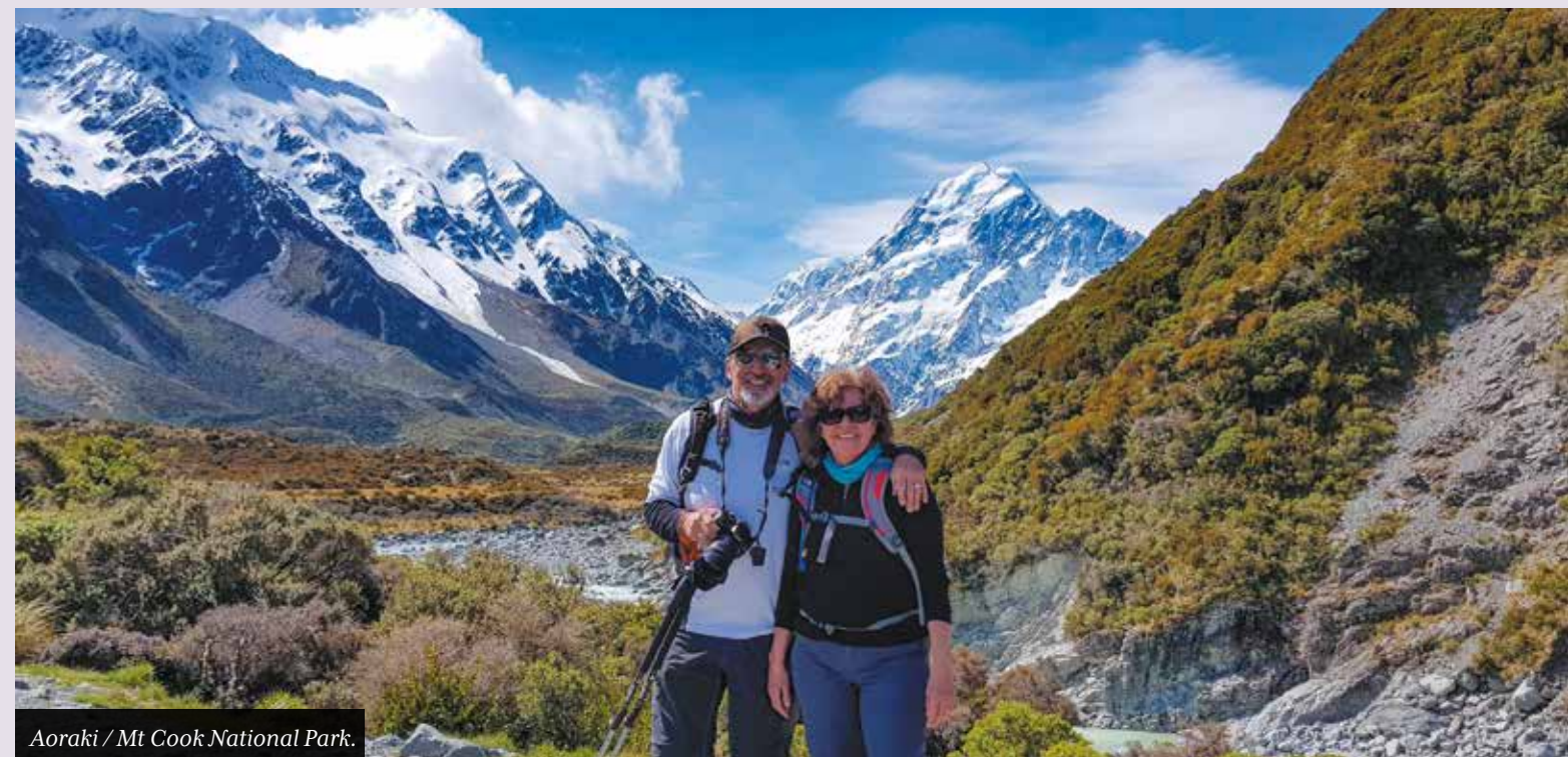
Aoraki / Mt Cook National Park.