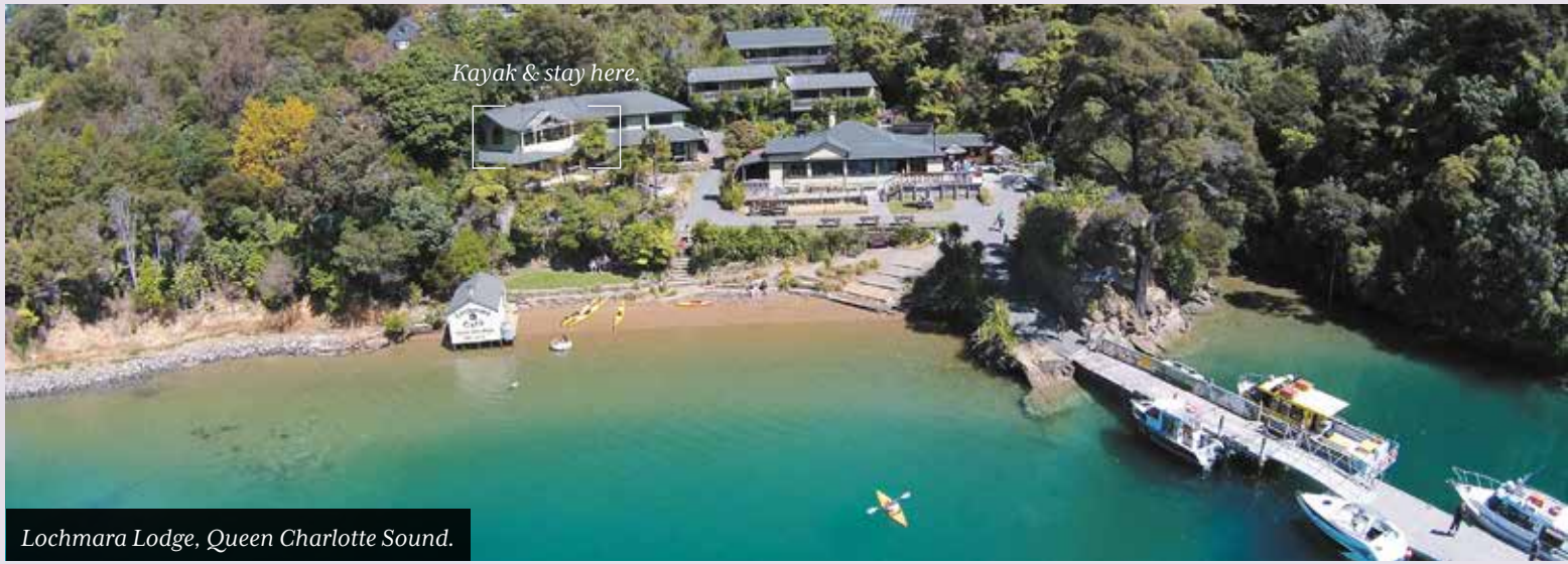
Kayak & stay here.