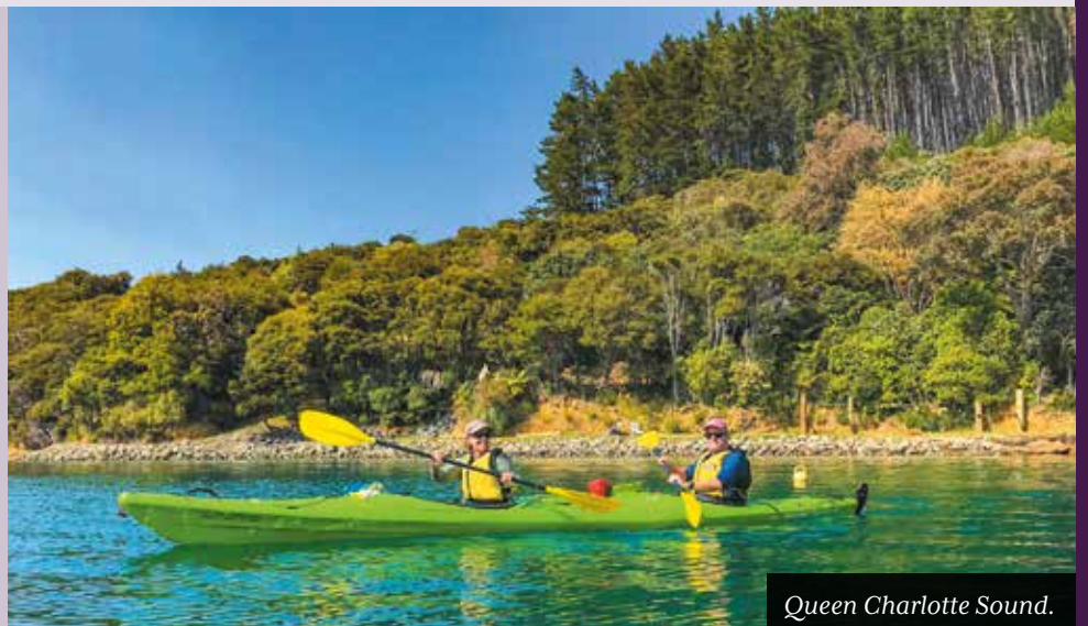
Queen Charlotte Sound.

make the most of every day, while you just relax and enjoy.