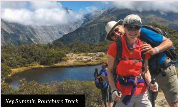
Key Summit, Routeburn Track.